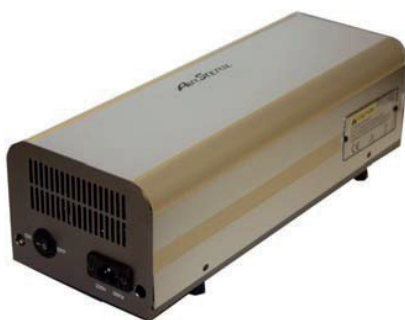
Air Steril MP 20 Test Unit

The HPA results on both air and surface contaminants clearly show the value of this technology as part of the infection control process in any medical environment. In addition to the extensive laboratory testing and validations the Air Steril units have been successfully installed, studied and tested in a variety of real world environments (customer reports and testimonials are available on request).