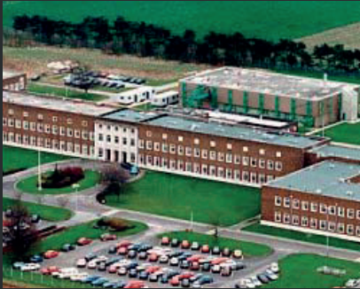
Porton Down Labs

Air Steril units will kill harmful airborne and surface viruses including Rhinovirus (Common Cold), Norovirus (Gastroenteritis) and Influenza. Even antibiotic resistant surface pathogens such as MRSA or C difficile are killed in all indoor areas.